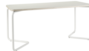
White + mushroom