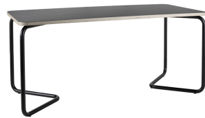
Black + charcoal