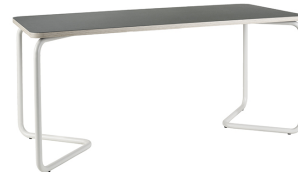
White + conifer